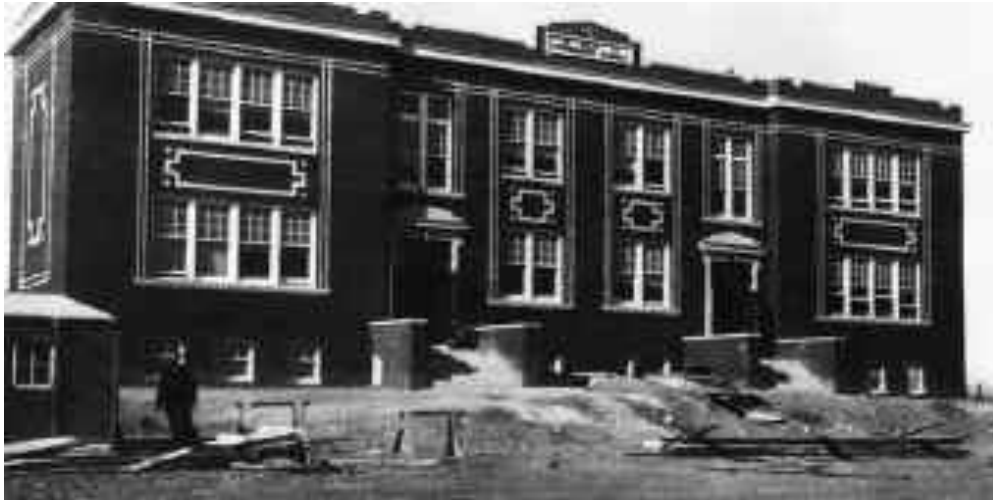
Mead Consolidated School building (year unknown)