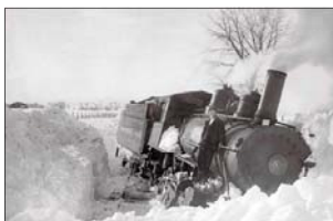
Blizzard of 1913. This engine derailed in Forbes Coates' field just north of the Mead station on December 13. The rotary plow came through the 14th to clear the tracks.