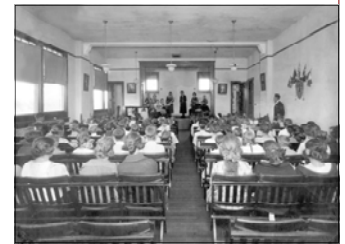
School concert circa mid. 1910s. This was held in the old Assembly Hall on Main street in Mead.

This building was also used as a Farmer's Union Hall and then later as the Town Hall. The Mead Consolidated Schools used the building as a gym and assembly hall until the mid. 1930s when the WPA built the school a gym. This building was eventually torn down in 2005 in order to build the new First National Bank of Mead.