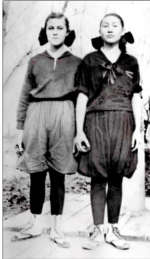
Two members of the first girl's basketball team at Mead Consolidated Schools 1920-1921 school year.